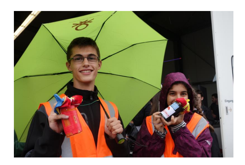
Students with their CanSats ready for launch during the 2017 European CanSat Competition

A CanSat can simulate an exploration flight to a new planet, taking measurements on the ground after landing. Teams should define their exploration mission and identify the parameters necessary to accomplish it (e.g. pressure, temperature, samples of the terrain, humidity, etc.).