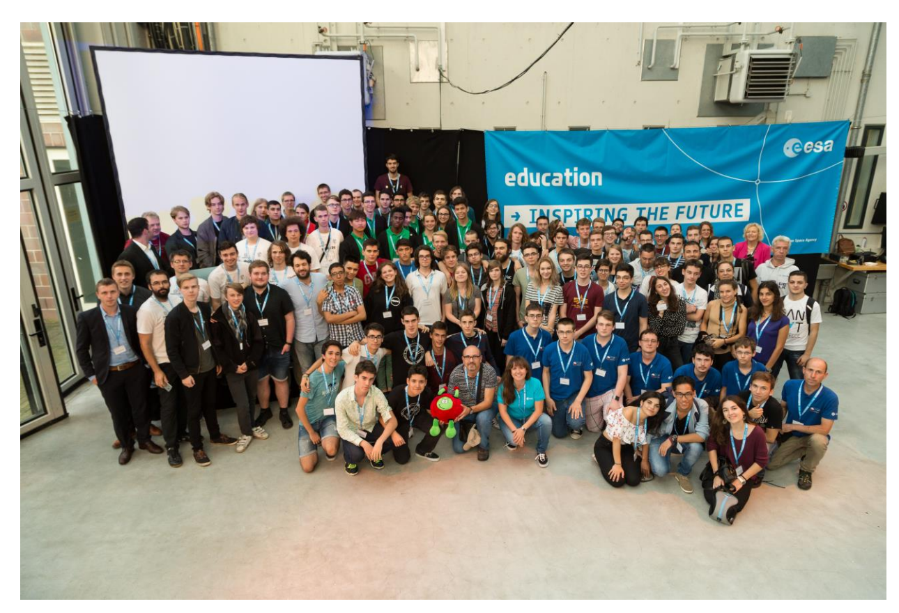
Participants of the 2017 European CanSat Competition at ZARM in Bremen

A CanSat is a simulation of a real satellite, integrated within the volume and shape of a soft drink can. The challenge for the students is to fit all the major subsystems found in a satellite, such as power, sensors and a communication system, into this minimal volume. The CanSat is then launched by a rocket to an altitude of about one kilometre, or dropped from a platform, drone or captive balloon. Then its mission begins. This involves carrying out a scientific experiment, achieving a safe landing, and analysing the data collected.